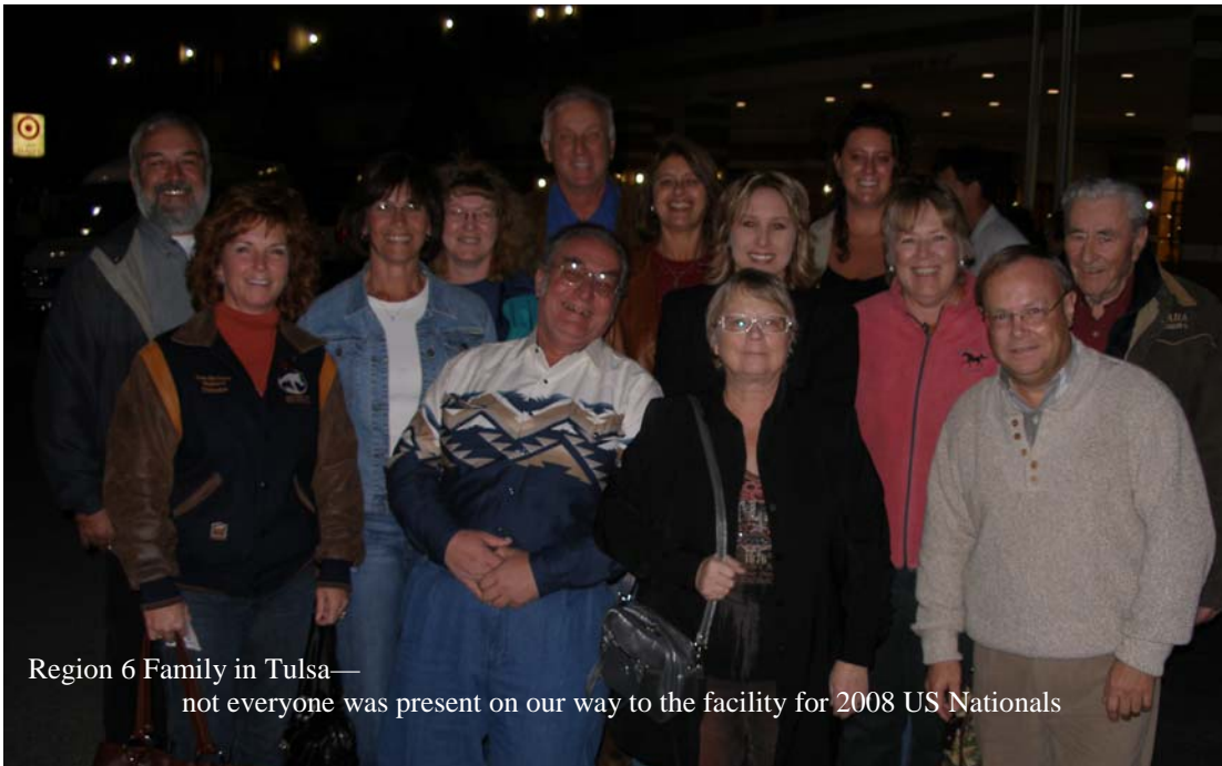
Region 6 Family in Tulsa— not everyone was present on our way to the facility for 2008 US Nationals

For more fun photos, look on our website at www.aharegion6.com !